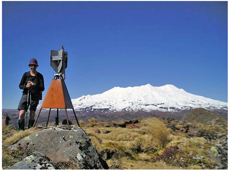
Above: Great views of Mt Ruapehu on the Hauhungatahi trip.

1499m bump north of the saddle from which we viewed the snow-capped ridge north to Sparrowhawk Bivvy. By now snow and hail showers were making life rather unpleasant so it was a case of back to the hut for a brief stop to refuel. Ahead lay a somewhat idyllic stroll down a snow laden beech forest path with afternoon sun breaking through the canopy and bird life singing away – wonderful.