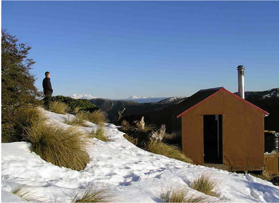
Above: Enjoying the view from McKinnon Hut.

Eventually the sign post to McKinnon came into view and we plunged over the side hoping to drop below the worst of the weather. It was