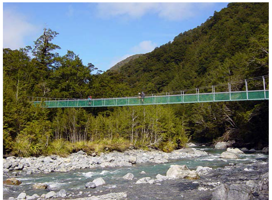
Above: Bridge over the Waingawa at Cow Creek.

The weather forecast for Saturday was unfavourable so the original plan to do the Oturere loop required modification. Instead we chose to go to McKinnon hut figuring that we could survive the worst the weather could throw at us for the quick dash across the tops. We would then be in a good position to make the most of the lovely weather