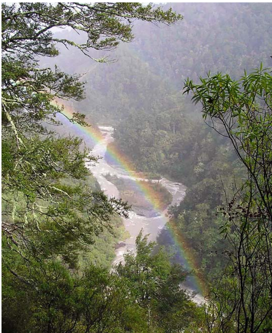
Above: Oroua River on the Irongate/Tunupo trip.

The varied experience of the 20 participants from all over the North Island, was catered for by the more experienced people acting as instructors of small groups, after a demonstration from Ray Goldring. Leadership of each group rotated. We camped on the snow, had a fireworks display (courtesy of RAL) at bedtime and woke to apricot sunrise on Mt Ngauruhoe.