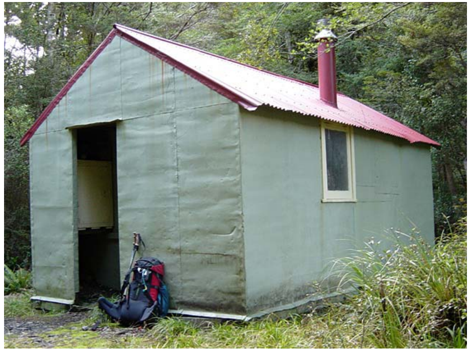
Above: Arete Forks Hut.

Once reaching the bushline proper the remainder of the downhill was